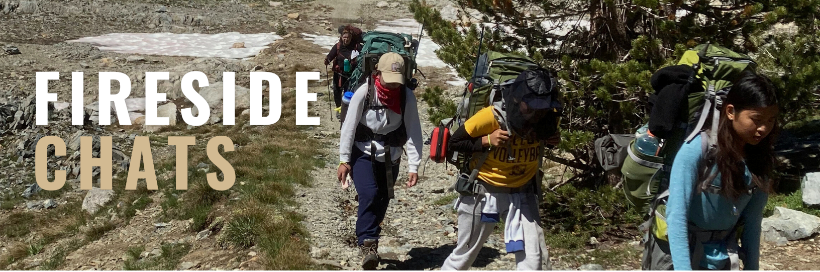
(Pictured third from front in the Sierra Nevadas on Leadership Program backpacking trip)